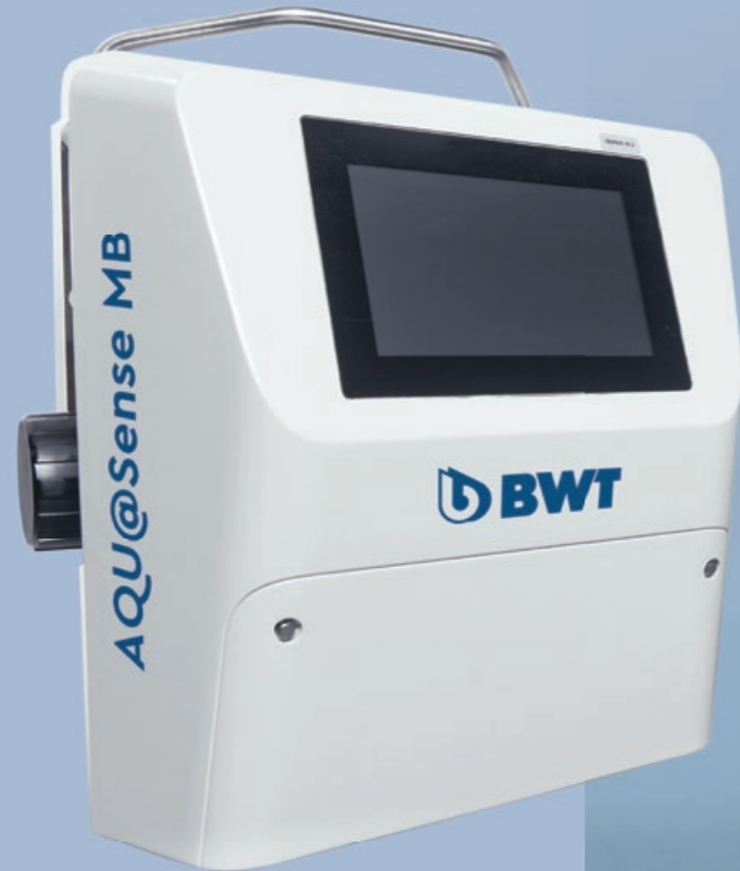
BWT AQU@SENSE MB

The time has come to use more accurate and rapid methods to determine the level of micro-organisms in water. BWT recommends flow cytometry, whereby a laser is used to count the cells of a water sample in the AQU@Sense MB measurement chamber. A fluorescent liquid is used to dye the cells' DNA in the sample to ensure reliable and accurate detection. This prevents extraneous particles from being counted as 'false-positives' and allows for detailed sample analysis. Operators can therefore obtain the total microbial cell count (TCC). RMM enable users to accurately assess water quality at any time, ensuring safer and more efficient plant operation.